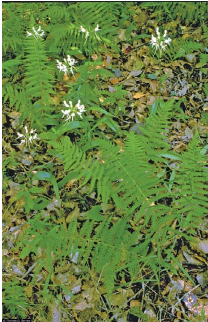
Platanthera integrilabia in its native habitat.

AS THE HUMAN SPECIES CONTINUES to multiply rapidly and search for food, shelter, and a better way of life, many orchid species will continue to be lost forever as their habitats fall victim to development. Most people associate this loss of habitat with the tropics, where most