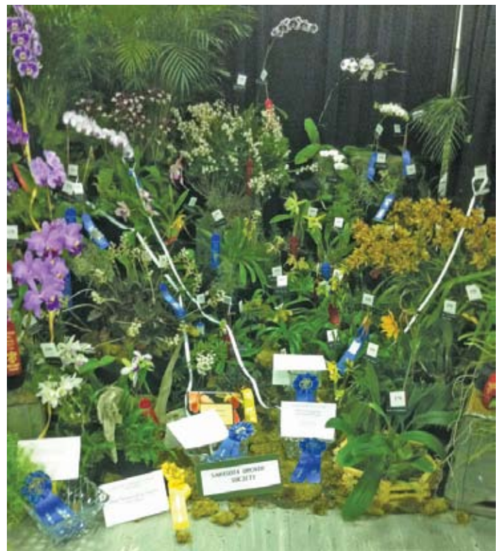
Exhibit and awards garnered by SOS at the Englewood Orchid Show.